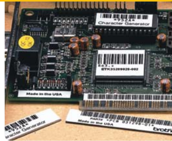
Manufacturing / Warehouse