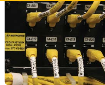
Telecom / Datacom