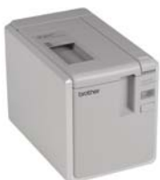
PT-9700PC (USB, Serial)