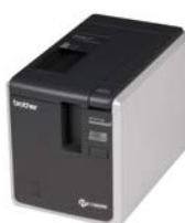
PT-9800PCN (USB, Serial, Host USB, Ethernet)